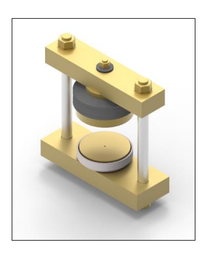
Figure 1: Clamp General Assembly